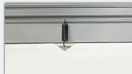
Screen material is held flat with Severtson Flex™ RTS