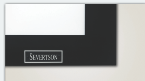
The velvet-wrapped frame provides a clean, crisp viewing edge.

Note: The most common sizes and aspects are listed here. Visit severtsonscreens.com/model/LF or contact a sales representative for more available sizes and specifications. Custom sizes available.